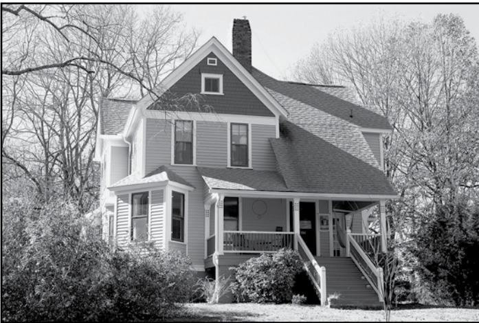
Hearn Home—144 Cumberland Avenue