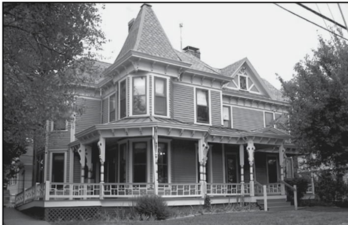
Gudger House—89 Montford Avenue