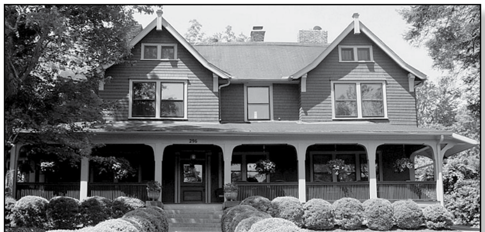
1900 Inn on Montford—296 Montford Avenue

This tour is for all of us, so I hope you'll plan to attend, volunteer, or donate and continue to help the Montford Neighborhood Association with improvement projects such as the Reed Creek Greenway extension, the Klondyke playground project, and programs for children at the Montford Community Center. Together we can make a difference in our historic neighborhood.