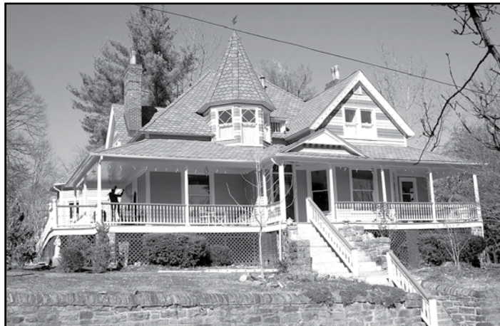
Chinese Acupuncture Clinic—369 Montford Avenue