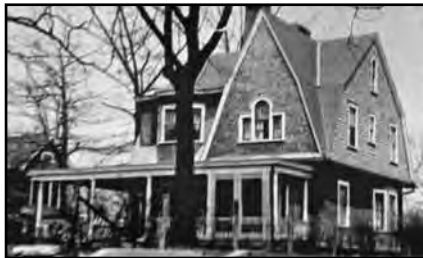
Pearson Home, 67 Cumberland Avenue.