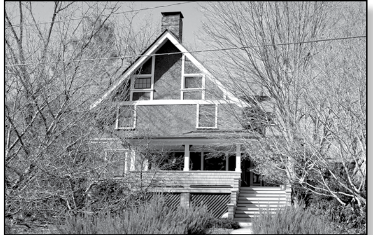
Ferris Home—17 Panola Street