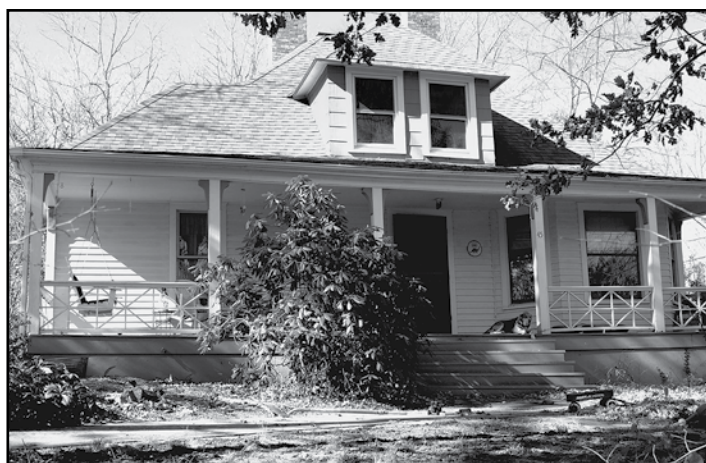
Russell Home—45 Panola Street