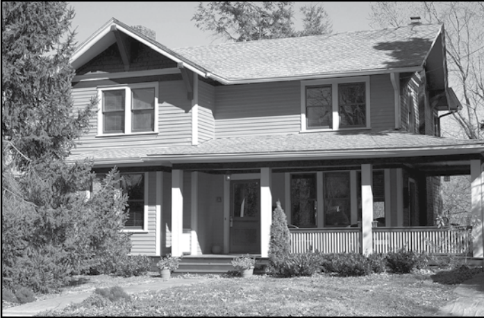
Nutter Home—169 Flint Street