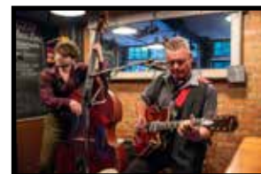
Bam-a-Lam - Lo-Fi Pop & Rock-n-Roll