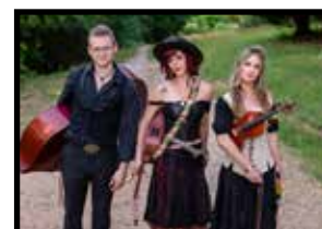
Fancy & the Gentlemen - Americana/ Country