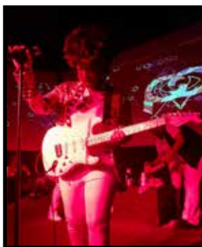
Lyric - R&B/Soul