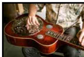
Ben Scales and Andy Pond - Bluegrass/ Newgrass