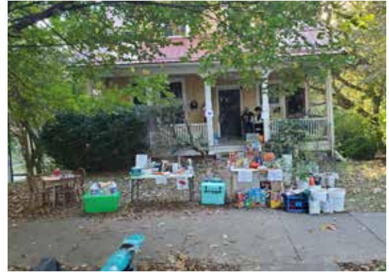
Free supplies at 246 Montford.