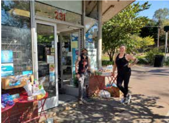
Montford Convenience Store employees distributing free supplies.