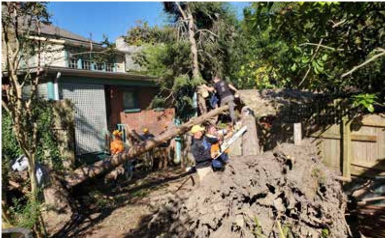
Baptists on Mission