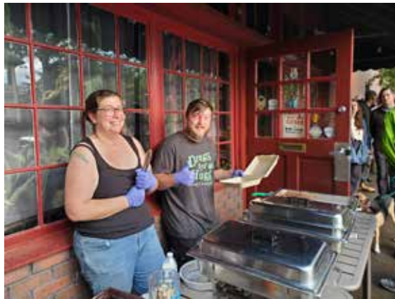
Nine Mile's free meal line.