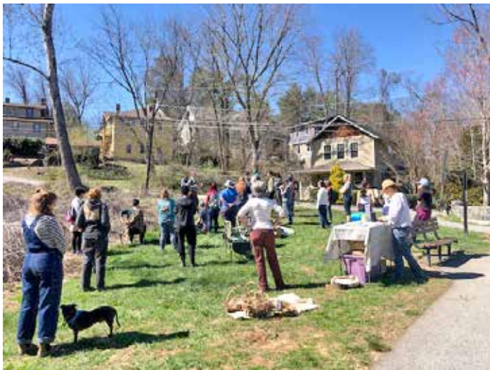
Great turnout for 2023’s first Community Through Kudzu! Lots of volunteer hours to be logged for our grant. More details to come.

The first workshop of 2023 was “ Weaving Birdhouses With Kudzu Vines ”