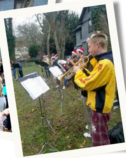
A special thanks to event sponsor Smart Feller Treeworks.