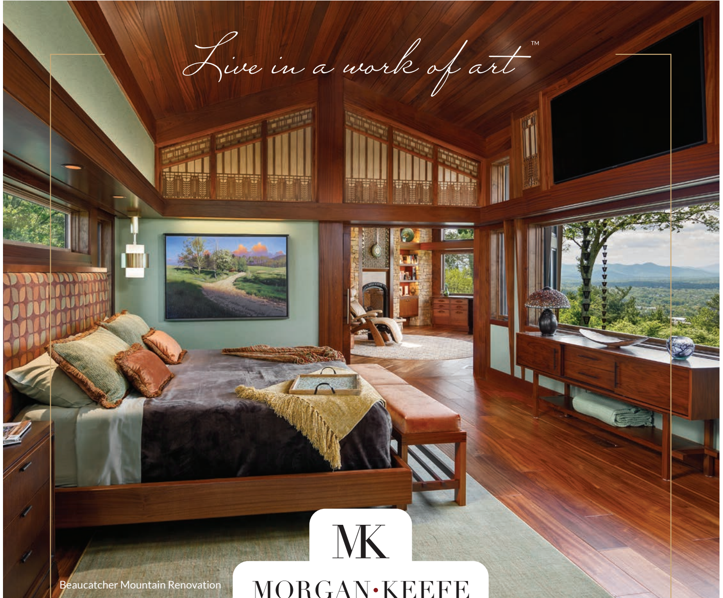
Beaucatcher Mountain Renovation