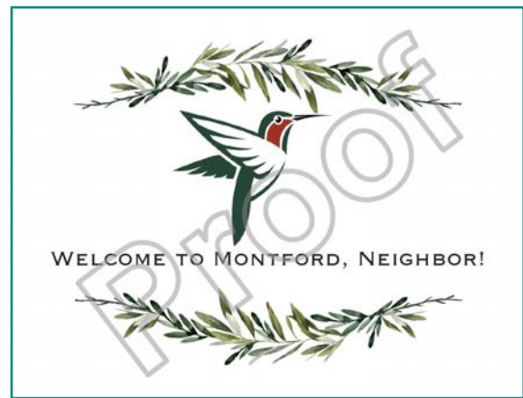
Welcome Packet Cover Idea