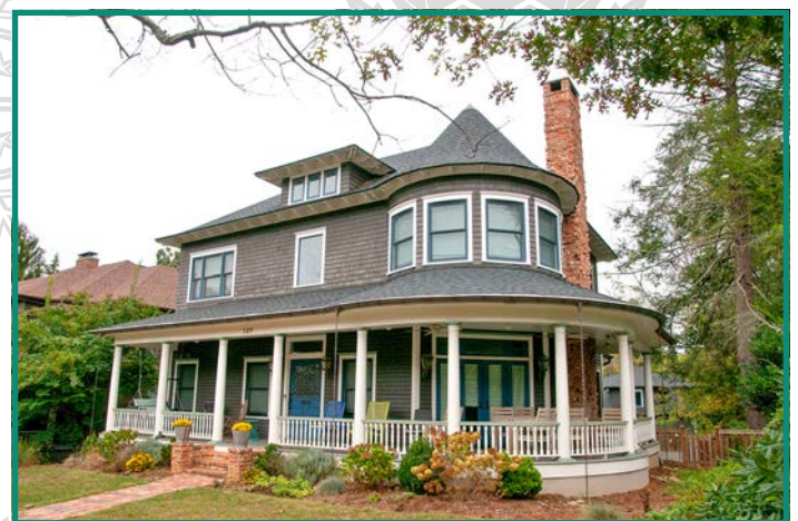
139 Montford Avenue