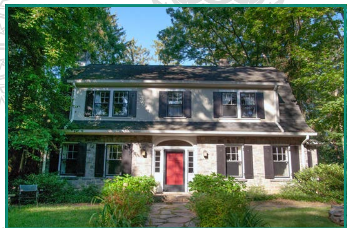
230 Pearson Drive