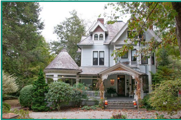
235 Pearson Drive, The Wright Inn