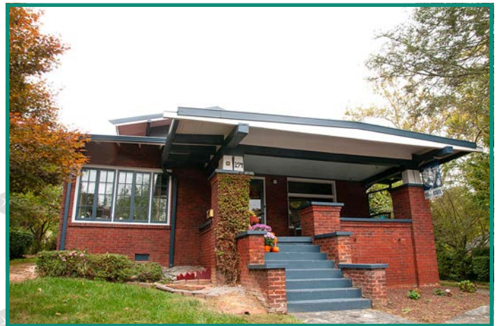
194 Flint Street