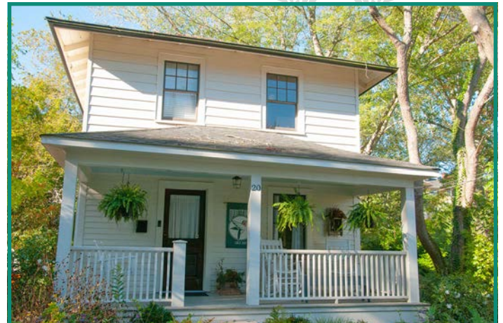
20 Woodlawn Avenue