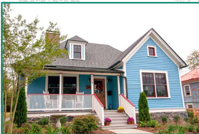
178 West Chestnut Street