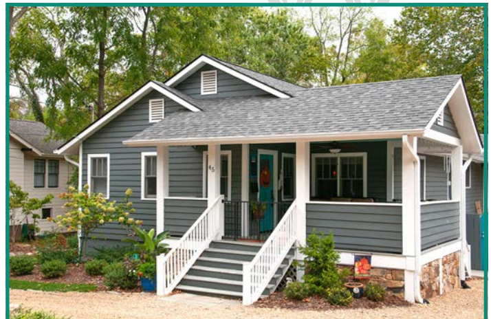
45 Pearson Drive

Visit montfordtour.com for more info and Tour updates.