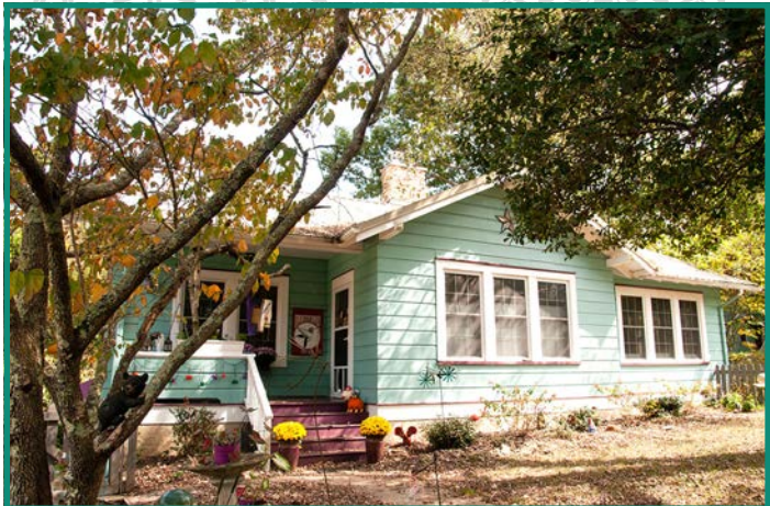
321 Pearson Drive