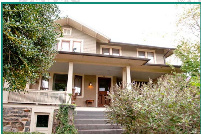
31 Panola Street