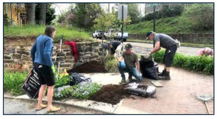
Forever Montford volunteers at work - April 2019 spruce up.

Other active goals of the committee include addressing the condition of the bus shelter in front of Bulldog Apartments on the north end of Montford, talking with City officials about installing trash cans in key public areas and improving the vacant lot at the intersection of