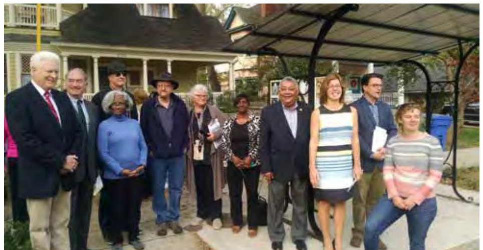
Dedication of the Bus Shelters, October 2017