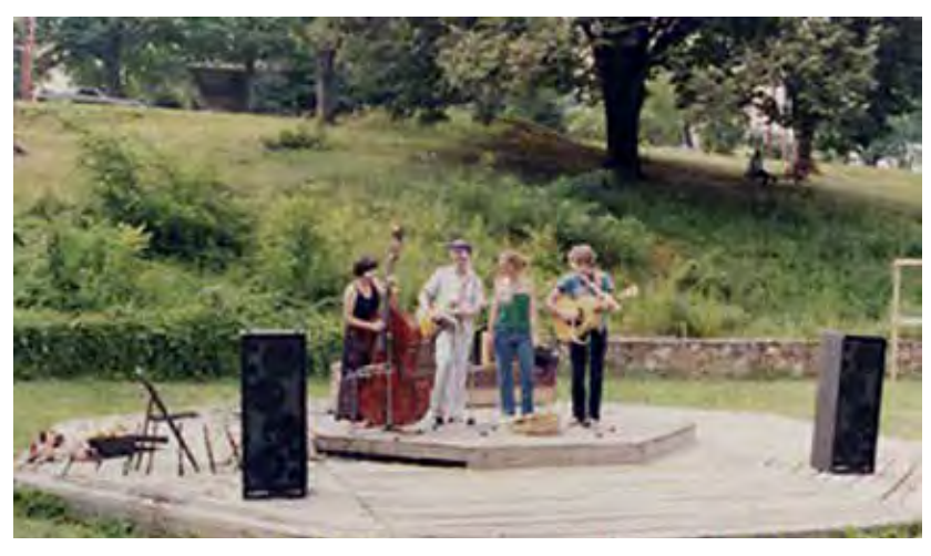
"Heartwood" performing in Montford Park.

"Sunday in the Park" was a series of five celebrations presented by Hallelujah Asheville, the Parks and Recreational Department, and the Community Arts Council of WNC on the last Sundays of the month.