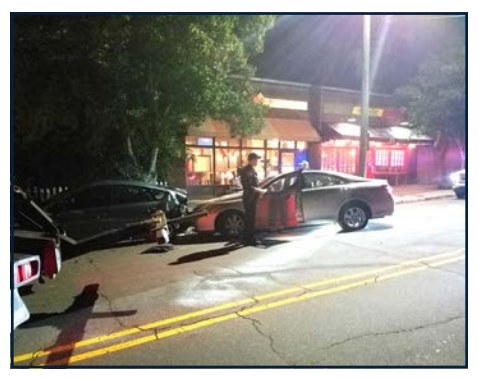
Three cars damaged in this pile up this month.

Runners know the length of Montford Avenue—while appearing level—is really a hill. Despite red lights and traffic calming islands, a driver traveling from downtown can get up quite a "head of steam." Add drugs or alcohol to the mix and you have a real problem.