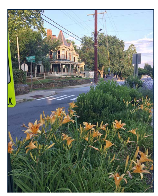
A rare quiet moment at sunset on Montford.