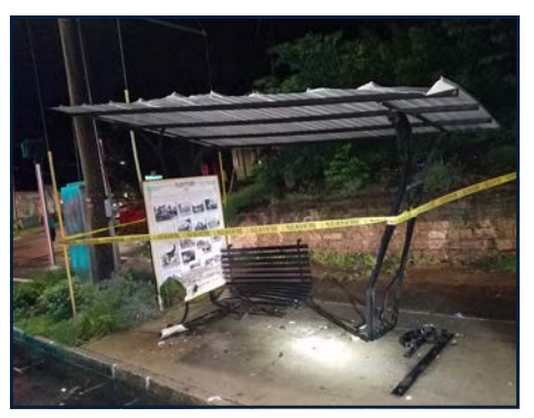
Montford's designer bus shelter and historic panel destroyed in May.

The Montford Neighborhood Association (MNA) has listened to the community and is exploring solutions to address speeding and drunk driving. Stay tuned .